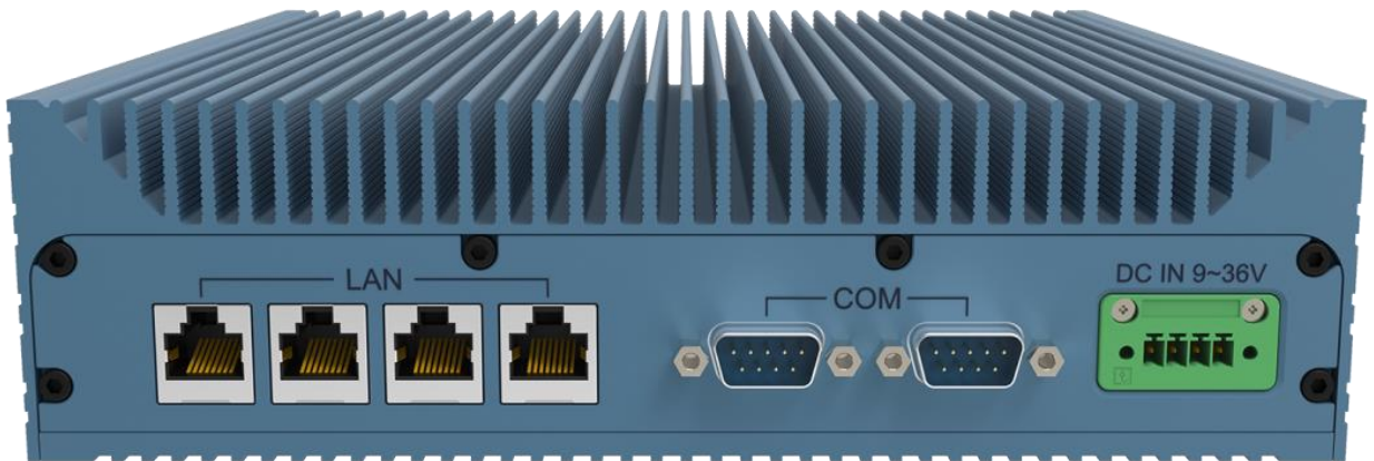
4x 1GbE RJ45 (option)